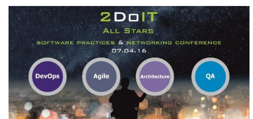
2doIT All Stars 2016