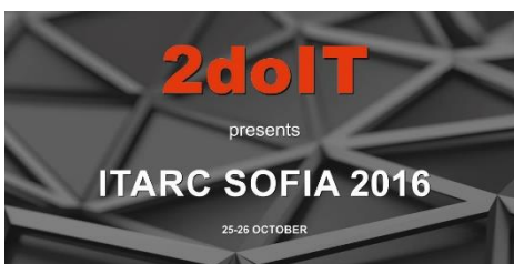
2doIT ITARC Sofia 2016