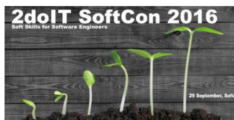
2doIT SoftCon 2016